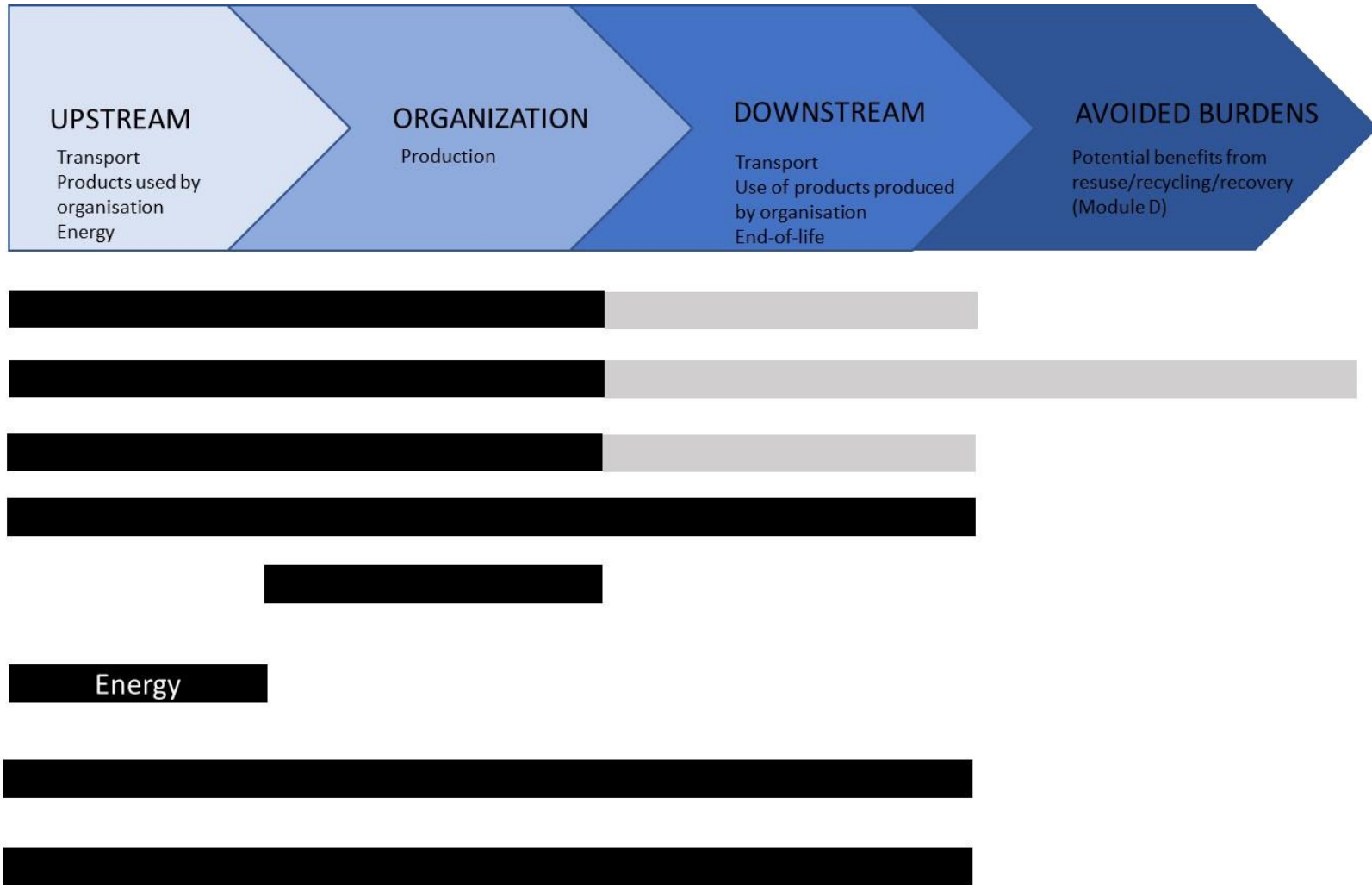
Figure 2 Illustration of how the different standards and frameworks relates to the system boundaries (life cycle phases). Solid black symbolizes mandatory life cycle phases, while grey illustrates optional life cycle phases.